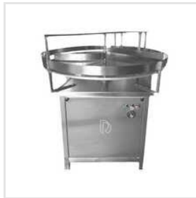
1440 RPM Turn Table Machine