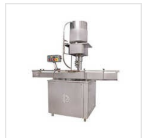
Automatic Single Head Vial ROPP Cap Sealing