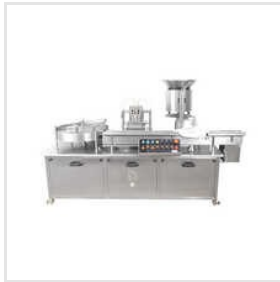
Four Head Vial Filling With Rubber