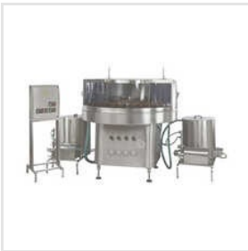
Single Phase Rotary Bottle Washing