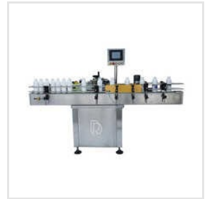
Automatic Self Adhesive Vial Bottle