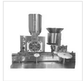
Three Phase Powder Filling With Rubber