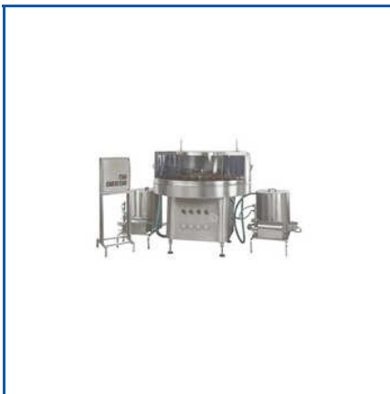
SINGLE PHASE ROTARY BOTTLE WASHING MACHINE

1440 RPM Turn Table Machine, Automatic Four Head Vial Sealing Machine, Automatic Self Adhesive Vial Bottle Sticker Labelling Machine, Automatic Servo Sticker Labelling Machine, Automatic Single Head Vial ROPP Cap Sealing Machine, Four Head Servo Filling Machine, Four Head Vial Filling With Rubber Stoppering Machine, Measuring Dosing Cup Placement And Pressing Machine, Single Phase Bottle Vial Filling Machine, Single Phase Rotary Bottle Washing Machine, Three Phase Auger Powder Filling Machine, Three Phase Powder Filling With Rubber Stoppering Machine, etc.