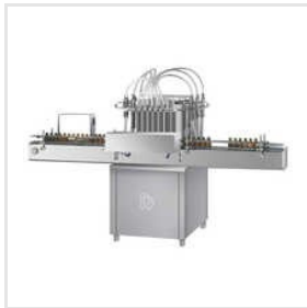
Single Phase Bottle Vial Filling Machine