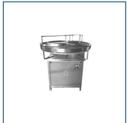
1440 RPM TURN TABLE MACHINE