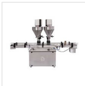
Three Phase Auger Powder Filling Machine