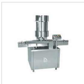
Automatic Four Head Vial Sealing Machine