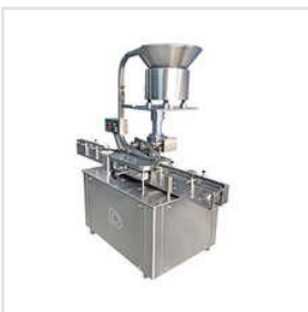
Measuring Dosing Cup Placement And