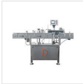
Automatic Servo Sticker Labelling