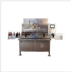
Four Head Servo Filling Machine